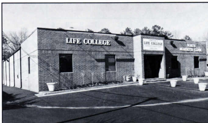
THE FINAL "ADJUSTMENTS" WERE MADE TO THE NEW SATELLITE CLINIC AND IT OPENED JUST IN TIME FOR SPRING.

tical sand dunes are already in use, paid for by the College. The community and Life's students use the facility as well Olympic and Olympic hopeful athletes from Russia, Mexico, Australia, Germany, Ireland and England, who are training for the upcoming 1996 Games.